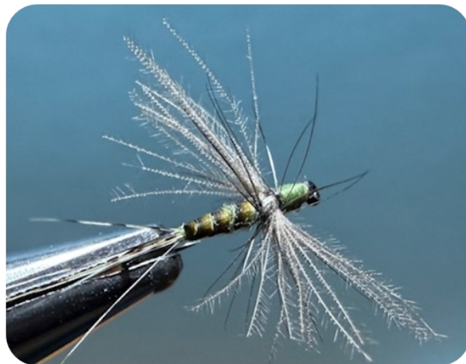
Blue Quill Spent From Neal Hoffberg