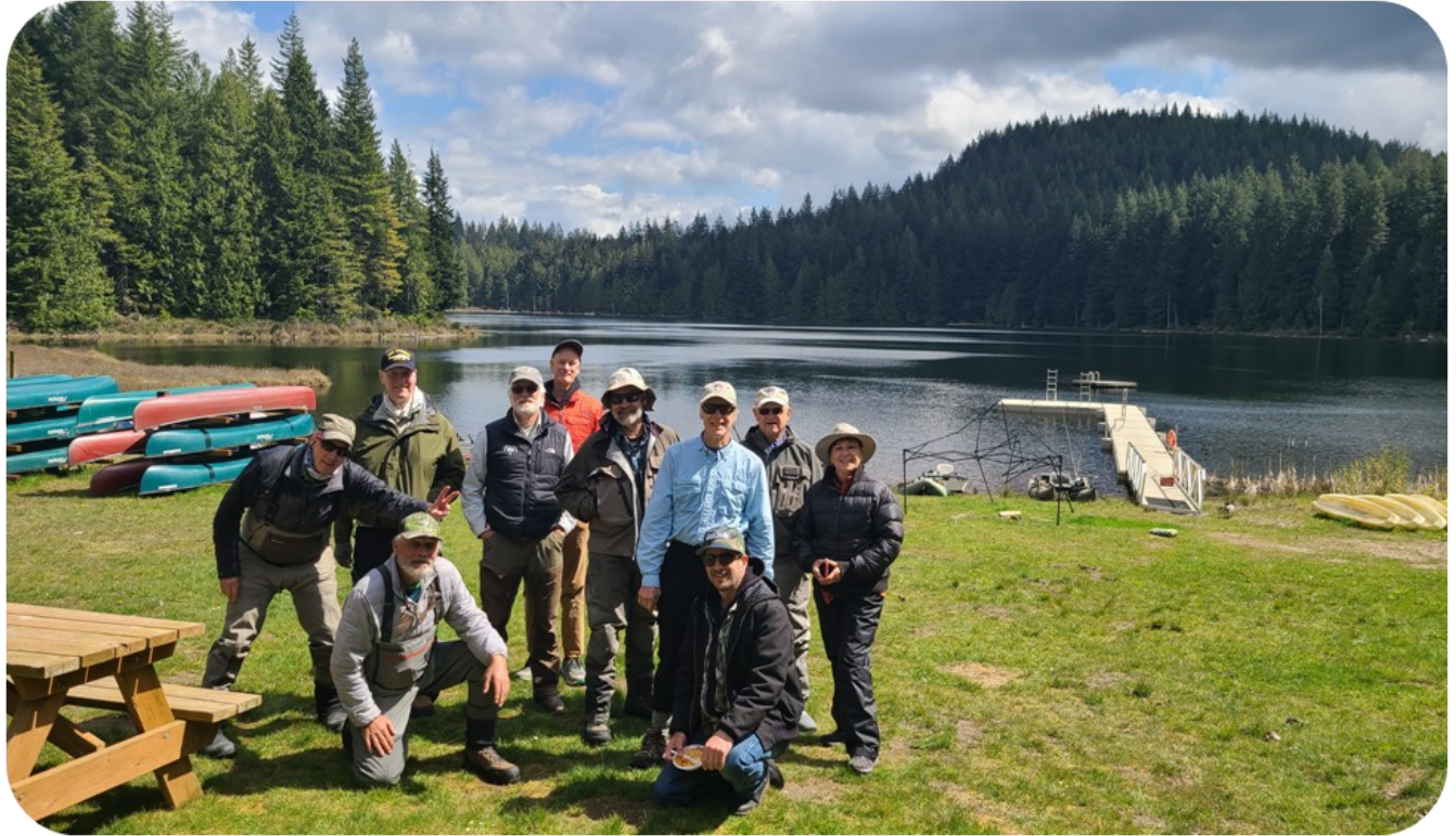
WFFC Hannan Lake Outing Participants