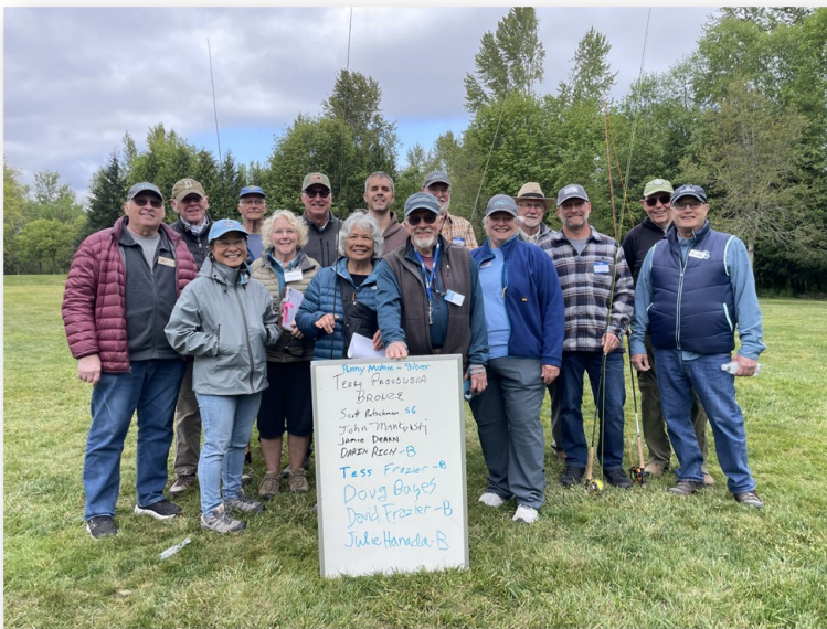
Volunteers that made the Skills Development courses a big success