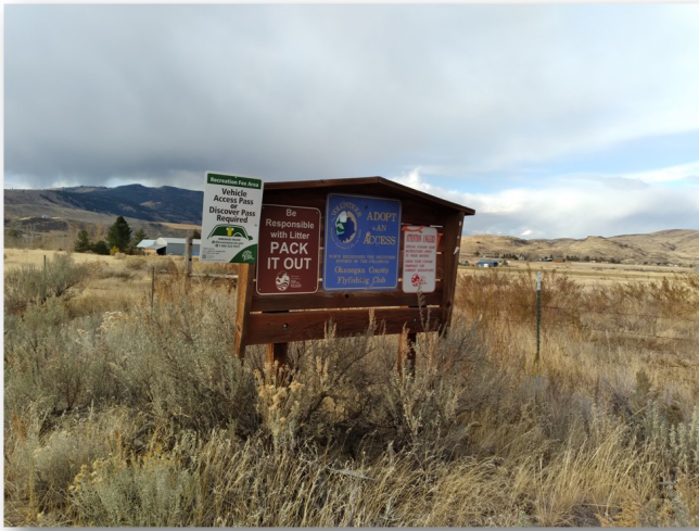
Entrance sign Aeneas Lake Keep your eyes open or you'll drive by it