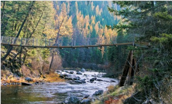
Rock Creek Montana

There were a few bugs coming off sporadically, none of the hoped-for October Caddis, and I didn't catch a thing on dries. I switched up to euro nymphing and managed to land a fish before we had to leave, so as to avoid a skunking. We've had a couple of club presentations about that form of fishing and it is worth giving it a try (unless you're a dry fly purist). Despite the poor results, the Rock Creek Valley is a wonderfully beautiful place that I can't get enough of.