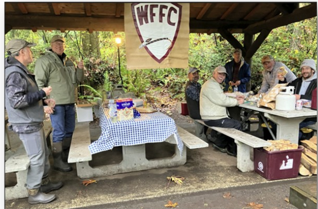
Wet Buns Wine and Cioppino Aficionados