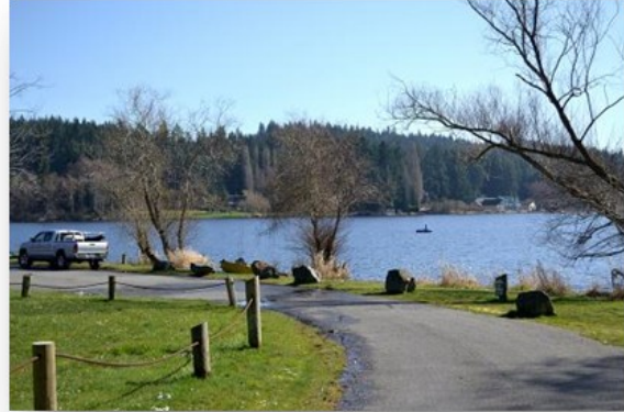
Lone Lake Launch

In the fall, I follow the toxic algae reports for Lone Lake on Whidbey Island and, once the reports turn negative, I try to fish at least once each autumn. A buddy and I headed up there in the first week of this month. I got on the water late, about 10:30, but my buddy, who got out an hour before I did, had six to hand by the time I hit the water. We each caught a few fish after that, but by 1 PM the bite was just off. Once again, Lone Lake fished well early, then petered out. Getting to the lake early, from Seattle, is a bit of an issue, as it requires a ferry ride. But in the future I'll make a point out of being on the first morning ferry. No bugs came off all day, we saw no rising fish. We took fish trolling and casting, counting down, and retrieving slowly. The fish seemed to be at depth and fast-sinking lines and prospecting patterns were the order of the day (pumpkin heads). All of the fish we caught were over 16", fat, healthy, and aggressive. One of mine jumped seven times during the play