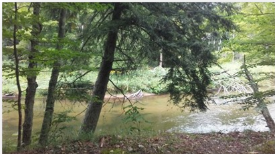
Pere Marquette River, Michigan

The run on the PM was good this year, with larger fish than normal, many running to over 30 pounds. Unfortunately, for unexplained reasons the runs on the surrounding rivers were not as good, so on the PM we were faced with a surplus of boats and other anglers this year. We fished lower in the river this year, halfway between Baldwin and Luddington, and found fresh fish in the dark water of deep holes and slots. The PM is a wild and scenic river. You aren't allowed to remove woody debris except to the extent necessary to allow a drift boat to pass. The river is full of sweepers, logjams, midstream logs, sharp rocks and ledges. You really haven't lived until you've seen a large king explode out of the depths, run upstream and down, while all the while you're wondering how the fish is going to beat you this time. I hooked around 20 salmon in three days and landed five. That's about par. Can't say enough good things about the experience.