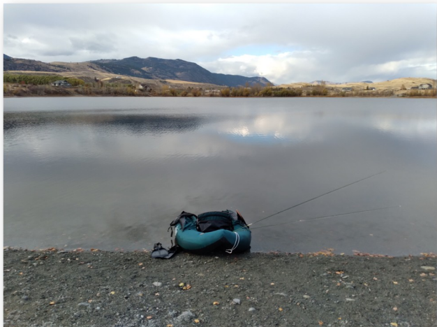
Aeneas : Cold Morning in a Float Tube Higher IQ people would have stayed in bed

I got to Aeneas around 10:00 and there wasn't a soul on the lake which troubled me a bit, 'where are the fisherman'? But fish were dimpling here and there on the surface so my reluctance to get in a float tube in 40 degree weather was quickly forgotten.