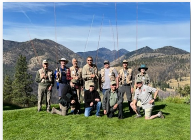
Reel Recovery Participants Sun Mountain Lodge, Winthrop WA