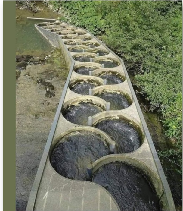
Fish Ladder Design –Switzerland Supposed to be much easier on the fish

Tesla valve-inspired fish ladders incorporate fluid dynamics principles to create a more fish-friendly passage. By adapting the valve's looping pathways and strategic flow redirection, these innovative structures offer several advantages over traditional designs: