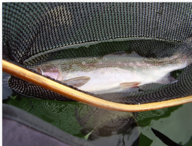
15-16' size also had the white blotches (growths)

"Everyone should believe in something; I believe I'll go fishing. " – Henry David Thoreau