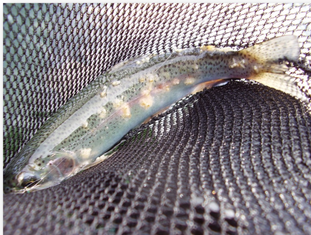
11-12' size note the white blotches (growths)

I was shivering and stiff when I stepped out of my float tube from a cold day on the lake and drove home with truck's heater full blast .