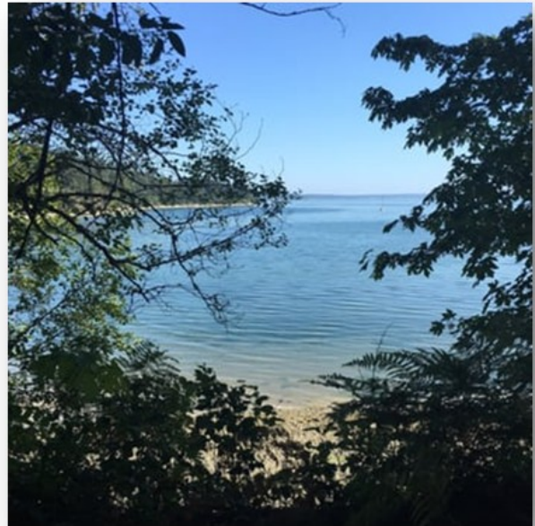
Penrose Point State Park

https://wffc.com/event/wet-buns-outing-november-2-2024/