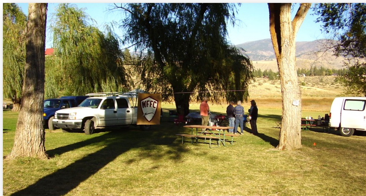
Big Twin Campground WFFC Arrival