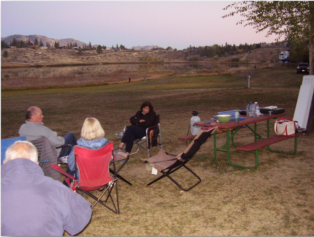
Slick Water on Big Twin = Tough Fishing