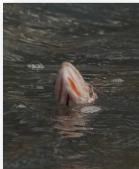
“Cutthroat Heaven” Coyote Creek Idaho

Your Creel Notes Editor’s Favorite Place