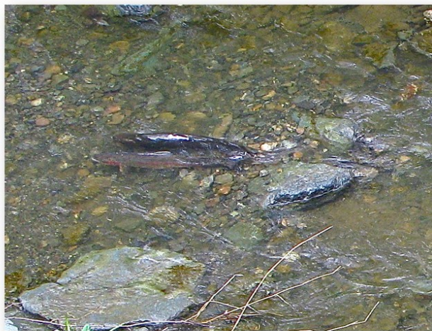
A Pair of Steelhead Spawning

Most of you know that the Washington Department of Fish and Wildlife stopped planting hatchery steelhead in many of our Puget Sound Rivers last year. This was done due to the threat of a suit by many of the conservation organizations in the area claiming that the continued planting of hatchery steelhead was damaging wild steelhead populations and thus violating the Endangered Species Act. The WDFW knew that the science and evidence was solid and that they would lose in court, so they agreed to stop planting hatchery fish in most of the rivers in Puget Sound.