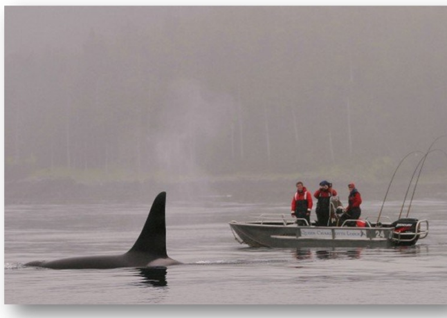
"Probably Too Big For Our Net"

Five minute epoxy can also be used. For an interesting effect, mix enough rubbing alcohol into Rit dye to liquefy it, and then mix the dye into the epoxy. Use this mixture to coat the thread bumps; it will create an interesting transparent effect. The alcohol will increase the drying time of the epoxy, so use just enough to liquefy the Rit dye.