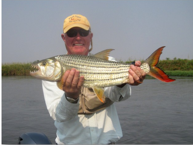
“Hold That Tiger”, Scott

reed beds. We fished two afternoon sessions and two morning sessions. We hooked but lost tigers the second and third sessions and finally landed a couple of tiger fish the last morning session. They hit the fly very hard, but are difficult to hook because their mouths are so hard, kinda like a tarpon with teeth.