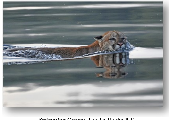
Swimming Cougar, Lac La Hache B.C.