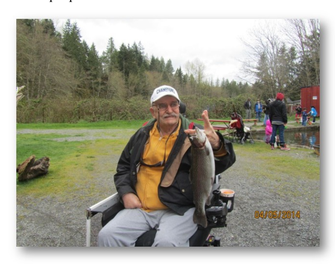
One Satisfied Veteran!

The big outing is the NW 2-Fly on the Yakima. This is a combined outing for all PHW groups in the northwest. This outing is held on the third weekend in September at the KOA campground in Ellensburg. This is again all catch and release fishing. We had 24 boats with one veteran one rower (boat owner) and one volunteer. With all the support volunteers there were more than 100 people involved.