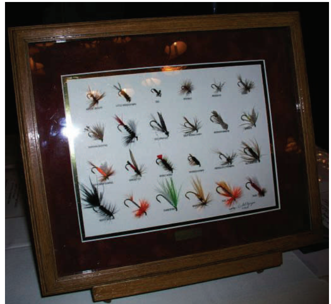
Fly plate for this year's auction.