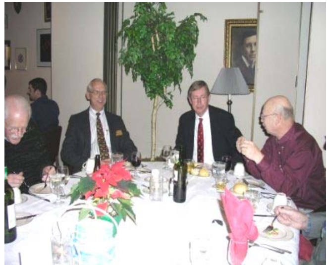
A fine dinner was enjoyed by all.