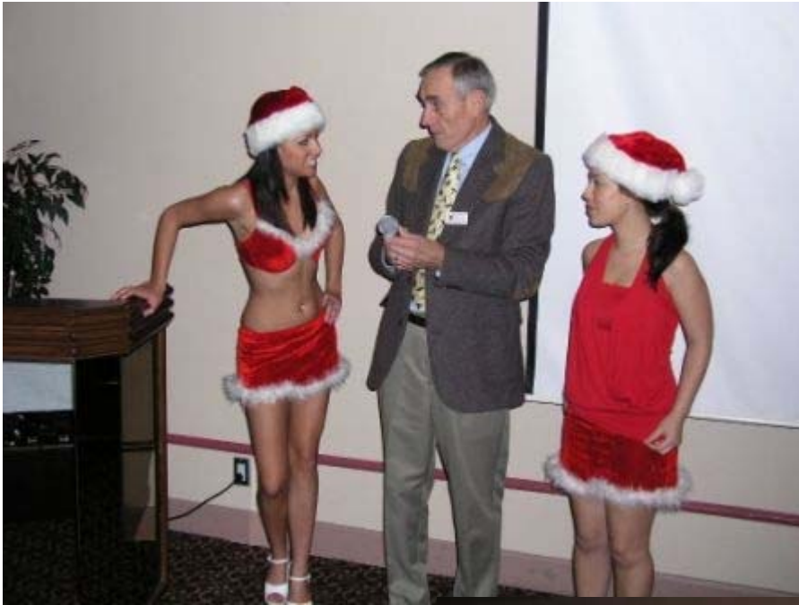
The proper spacing!