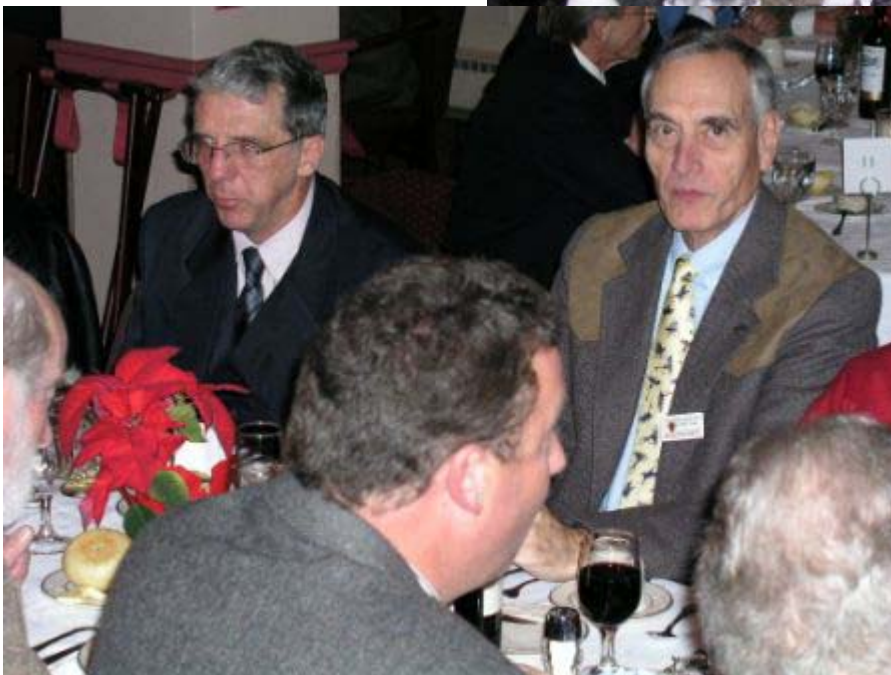
His last meal in office.