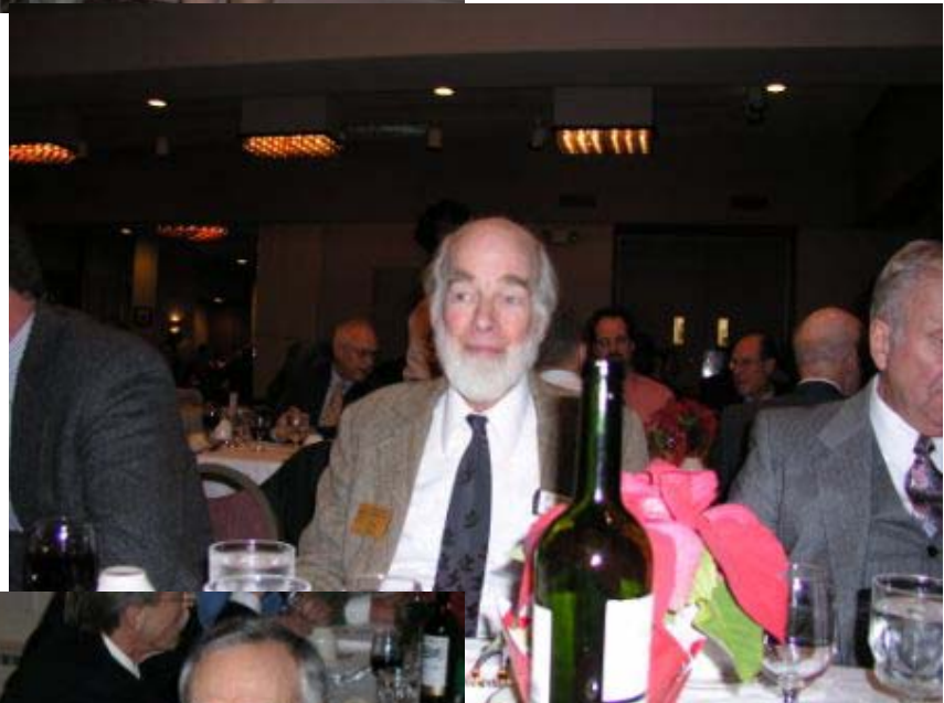
Not time for wine yet.