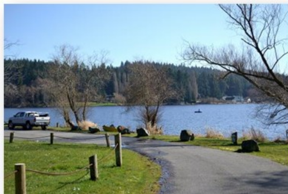
Nice Launching at Lone Lake