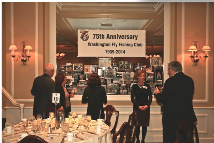
75 Years of WFFC