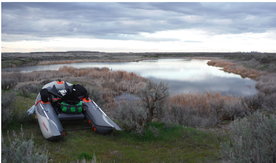
Quail Lake hold big trout who like little scuds.

I arrived at Quail lake last Thursday about 8:30 AM from my Othello hotel. Hauling a pontoon boat on the ½ mile dirt road/trail, crossing over two cattle gates is quite a test. The lake was fairly calm and quiet except for the birds. My first fish came on a black and silver mini leach pattern, a very nice brown. The next catch was a dark rainbow taken while striping in towards shore. My third and final fish, a nicer looking rainbow was caught on a small olive scud. The smallest of the three fish was 17". I was the only one on Quail lake that day, well worth the extra effort. Having a companion on this trip would be helpful for getting the boats in and out.